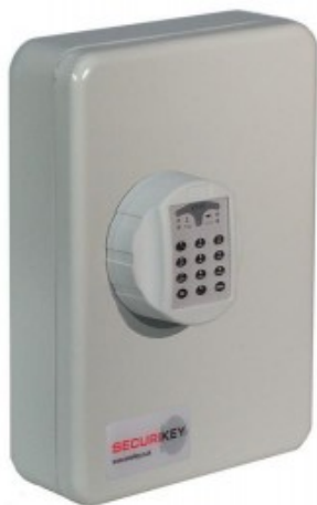
System 30 Electronic Lock REVO A