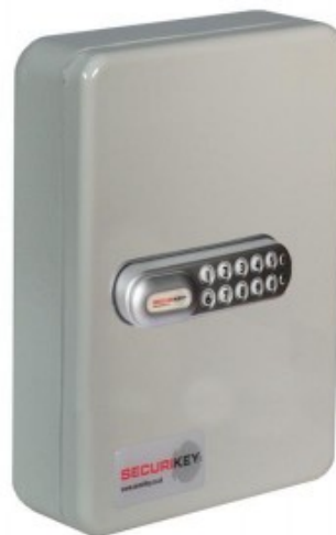
System 30 CL1000 Electronic Cam Lock