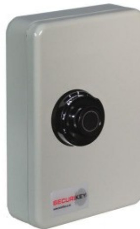
System 30 Dial Combination Lock