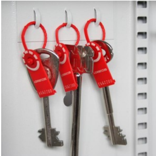
Security Seals & Loops