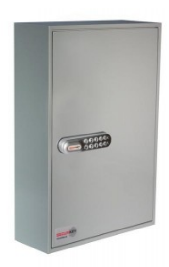
System 150 CL1000 Electronic Cam Lock