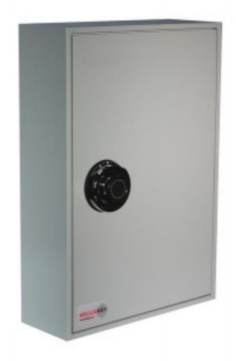
System 150 Dial Combination Lock