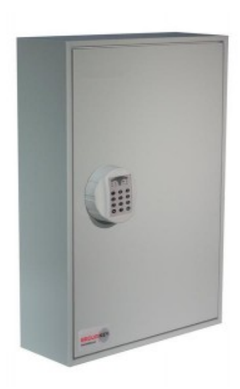
System 150 Electronic Lock REVO A