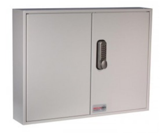
Deep Key Vault 200 Push Button Combination Lock