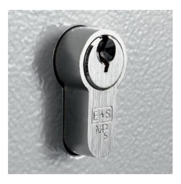
Euro Profile Cylinder