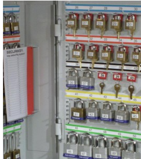
Key Vault Padlock Interior