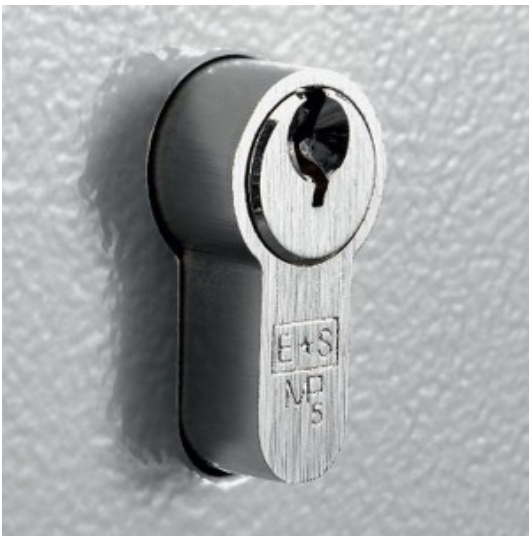
Euro Profile Cylinder