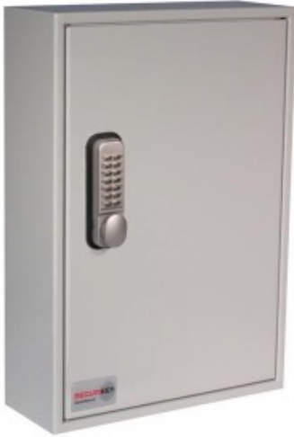
Key Vault Padlock 50 Push Button Combination Lock