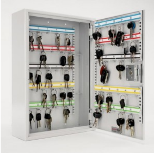
Key Vault Padlock 50