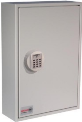
Key Vault Padlock 50 Electronic Lock REVO A