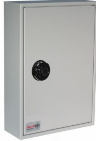
Key Vault Padlock 50 Dial Combination Lock