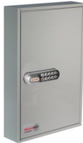
System 64 CL1000 Electronic Cam Lock