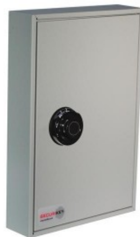
System 64 Dial Combination Lock