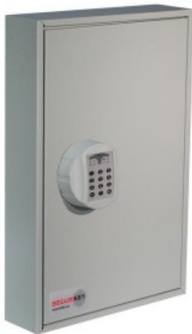
System 64 Electronic Lock REVO A