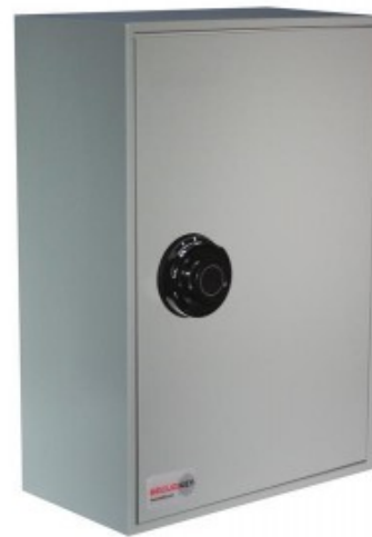
System 250 Dial Combination Lock