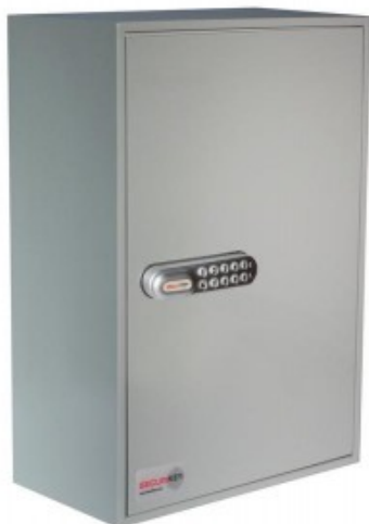
System 250 CL1000 Electronic Cam Lock