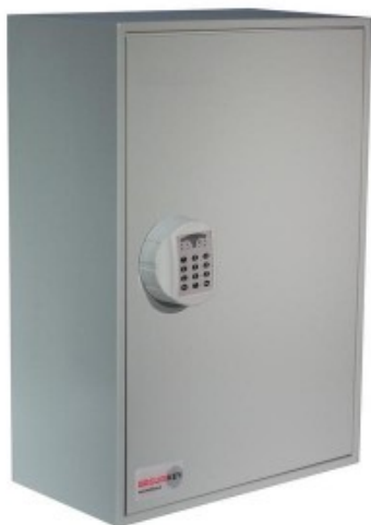
System 250 Electronic Lock REVO A