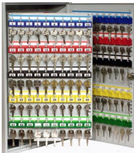
System Cabinet Inner Leaf