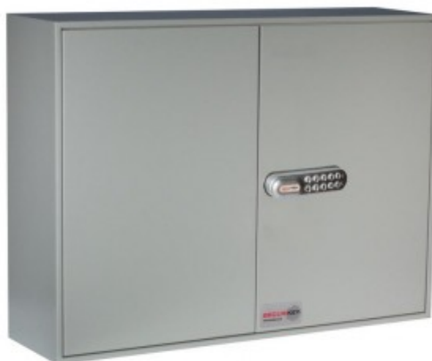
System 500 CL1000 Electronic Cam Lock