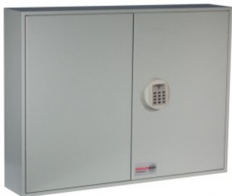
Deep System 200 Electronic Lock REVO A