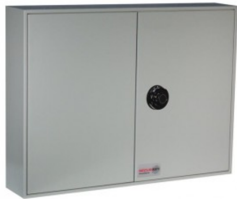
Deep System 200 Dial Combination Lock