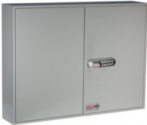
Deep System 200 Electronic Cam Lock CL1000