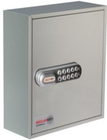
System 24 Padlock CL1000 Electronic Cam Lock