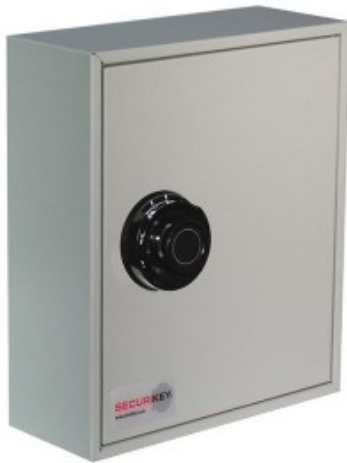
System 24 Padlock Dial Combination Lock