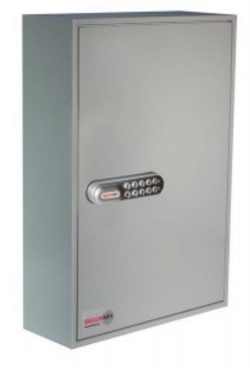
System 50 Padlock CL1000 Electronic Cam Lock