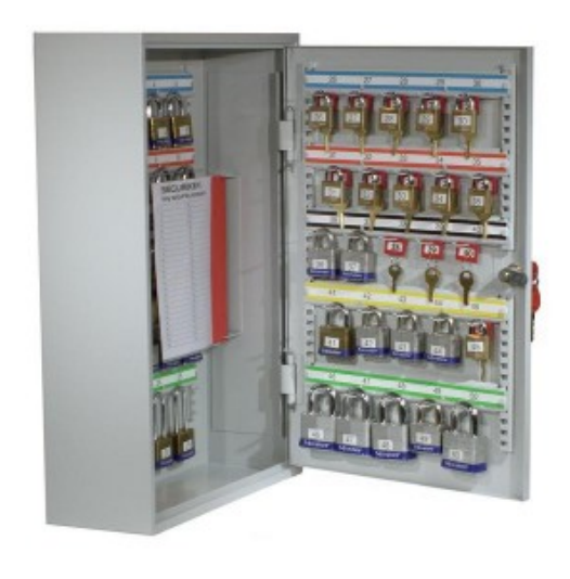
System 50 Padlock