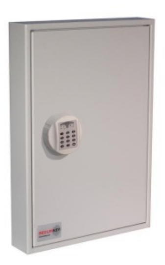
Key Vault 100 Electronic Lock REVO A