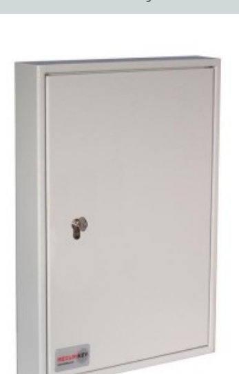
Key Vault 100