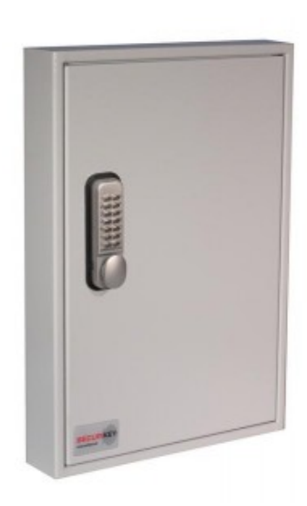
Key Vault 100 Push Button Combination Lock