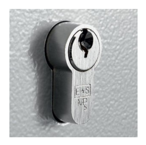
Euro Profile Cylinder