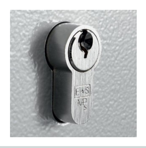
Euro Profile Cylinder