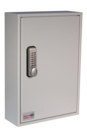
Key Vault 200 Push Button Combination Lock