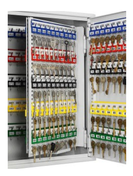
Key Vault Interior