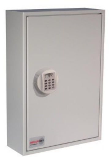
Key Vault 200 Electronic Lock REVO A