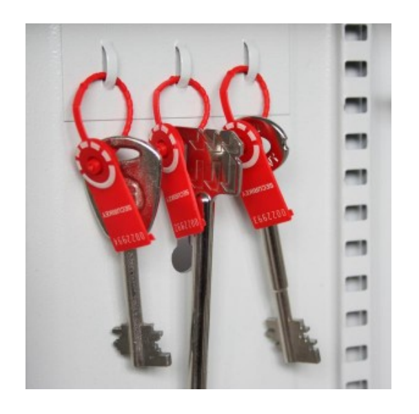
Security Seals & Loops