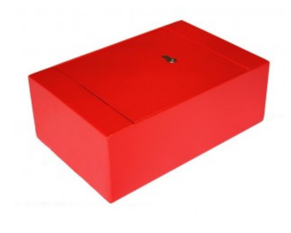
Cupboard Safe With Euro Profile Lock